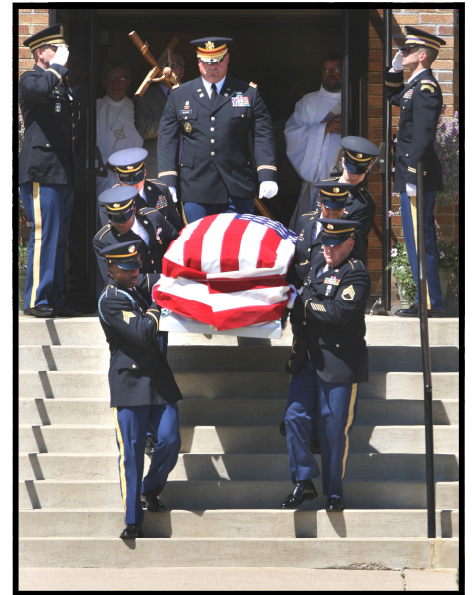
August 9, 2011